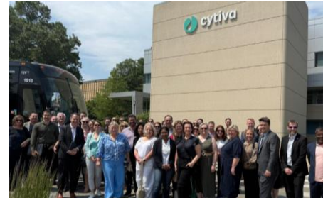
BIO 2025 Pre-conference site visit tour to Cytiva- Australian Delegation