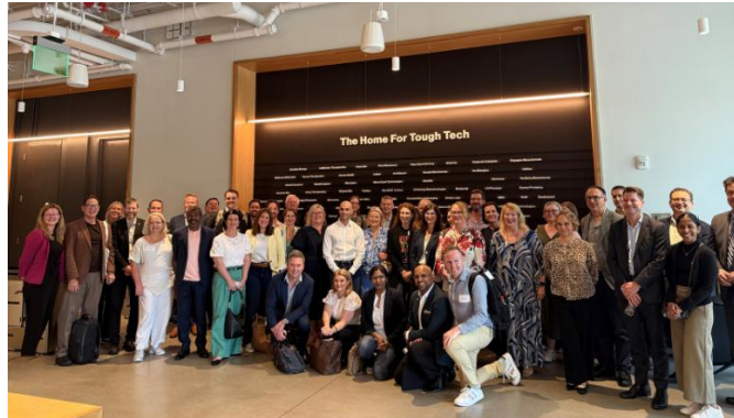
2024 Site Visit Attendance