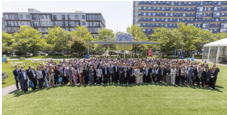
Team Australia BIO 2025 – Boston